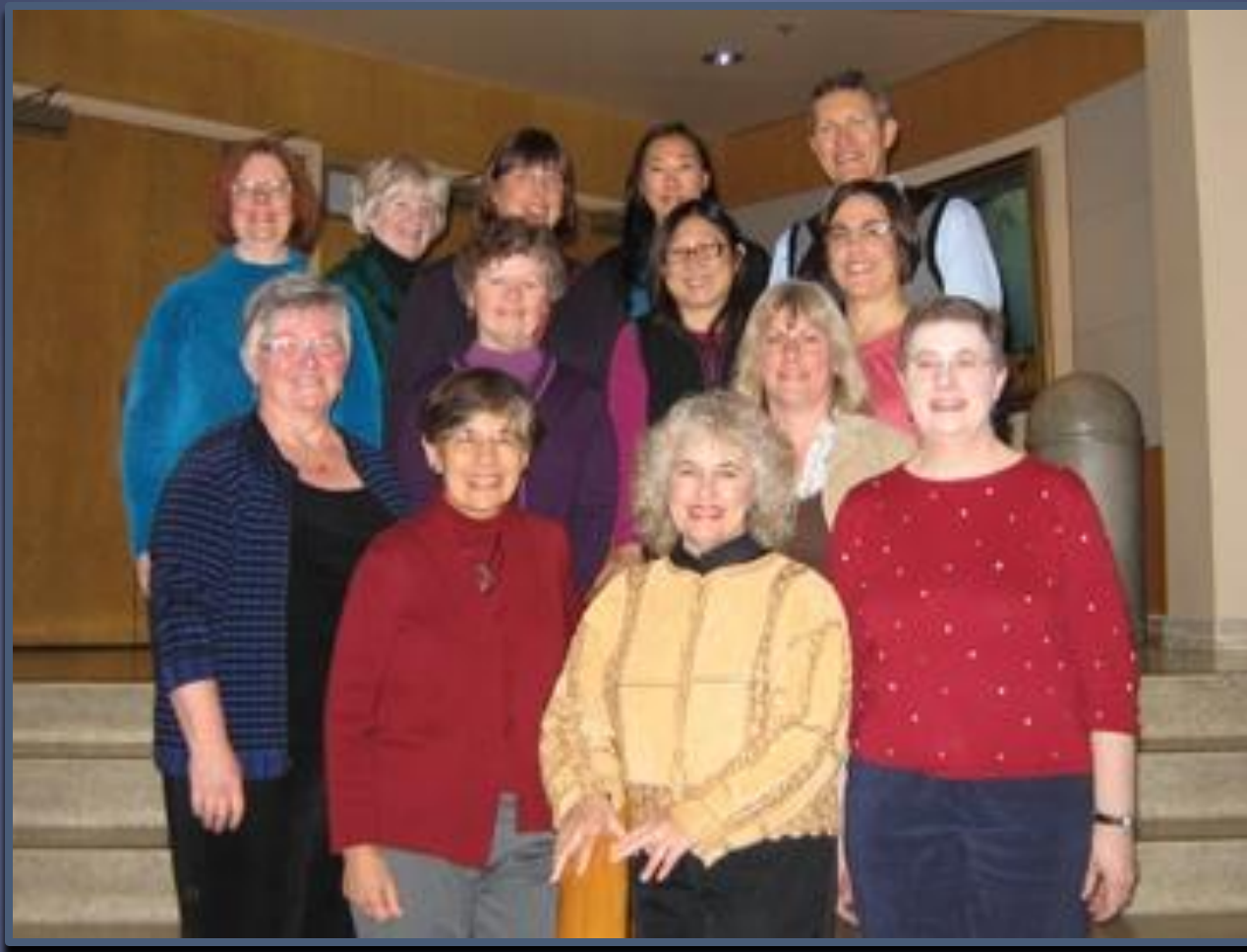
Health Sciences Library Liaisons