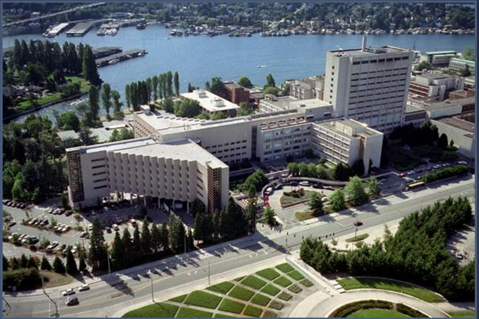
University of Washington Health Sciences